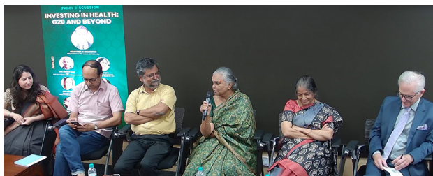
Panel Discussion, September 2023