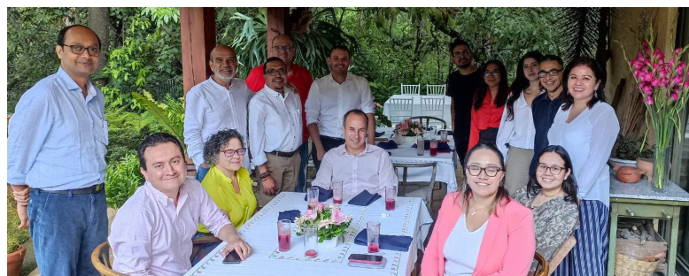
Mexico meeting, August 2023

The Study partners from Imperial College London, University of York, and all country partners met in Cuernavaca, Mexico, in August 2023 to review the country plans, exchange feedback, and identify collaborative activities across the four countries. A meeting was held in London in hybrid mode in January 2024, attended by all country PIs and experts.