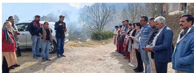
Power-walk activity, Nagwain workshop