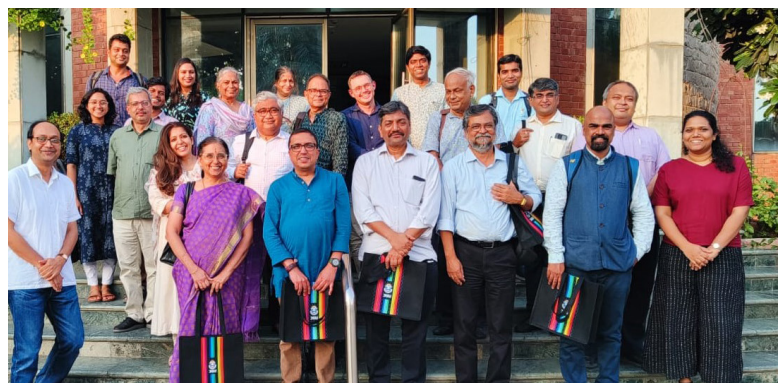
Protocol workshop, September 2023

In December 2022, a partners' meeting was held hybrid at, New Delhi to review the India plan and identify immediate action required for the project initiation. In March 2023, a protocol development workshop was held in New Delhi to discuss a common understanding of the research project and details of each work package. In July, another meeting was held at IIT Madras to establish a structure and methodology for Work Package1 related objectives. The next protocol development workshop at New Delhi in September 2023 involved detailed presentations on the conceptualization, study design and tentative timelines for work package.