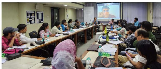
Tool training workshop, Kolkata