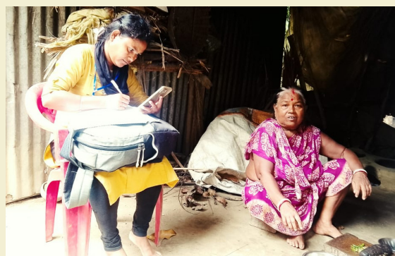
Survey, West Bengal

Meghalaya in collaboration with the Institute of Economic Growth (IEG). 1,300 households were sampled from Meghalaya in three districts (Khasi Hills, West Garo Hills, Ri Bhoi) from April to November 2024.