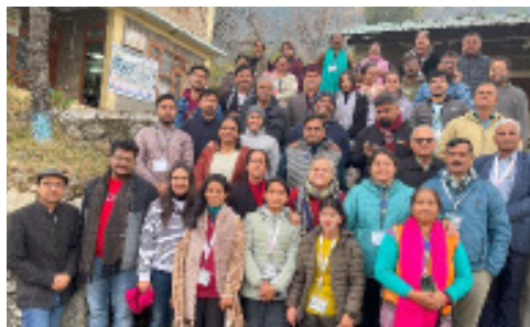
Field visit, Bhubaneswar, 2024

Eastern and Central workshop (in collaboration with PHRN) with 110 participants from 10 States was held in Bhubaneswar, Odisha in February 2024. There were participants from Bangladesh and Nepal as well.