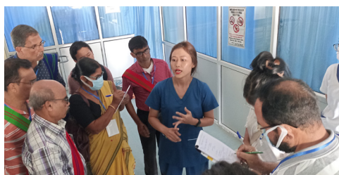
Northern workshop, Nagwain, 2023